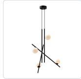
CH89832-BK/GO-UNV Black/Glossy Opal Glass