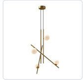
CH89832-BG/GO-UNV Brushed Gold/Glossy Opal Glass